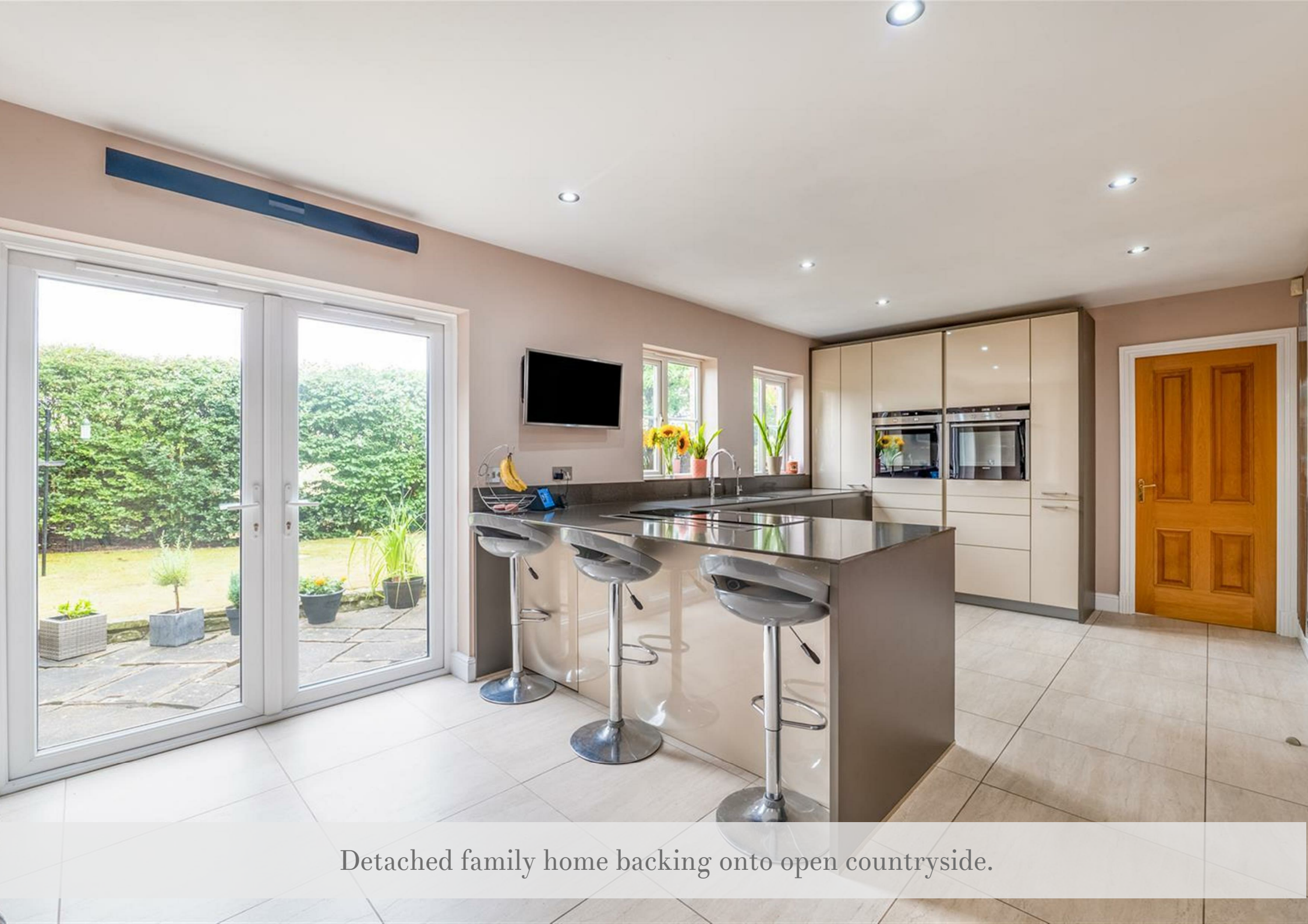
Detached family home backing onto open countryside.