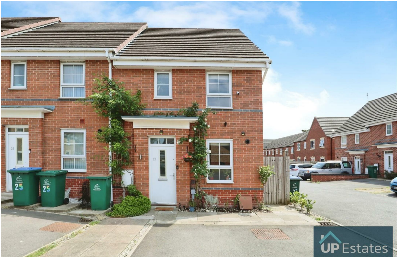
Marjorie Way, Coventry