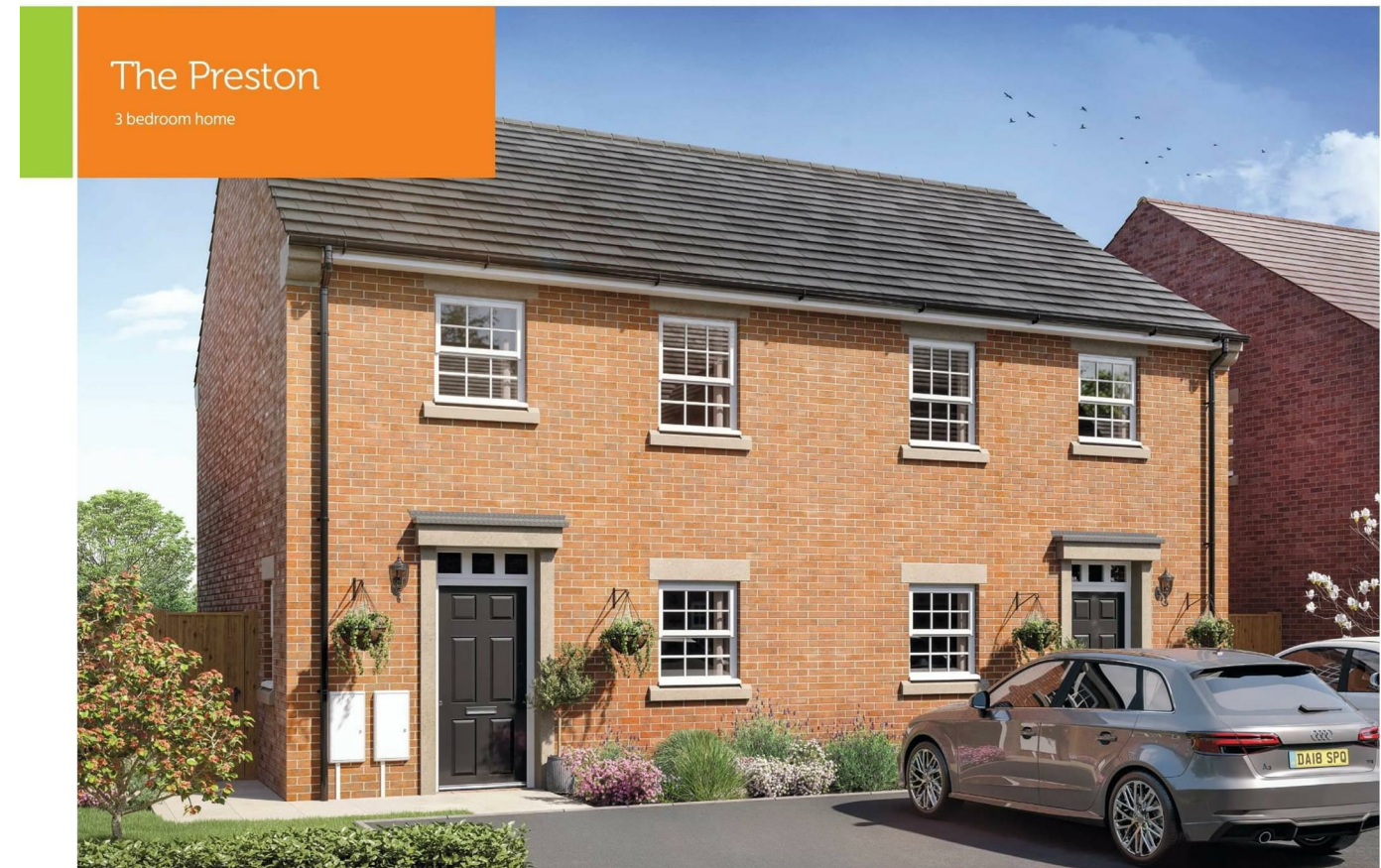
The Preston 3 bedroom home