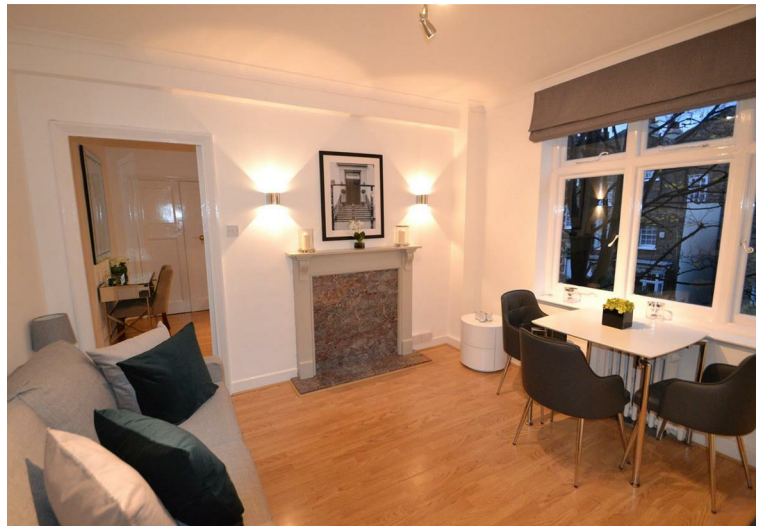
Abercorn Place, St Johns Wood, London £330 Per Week Furnished